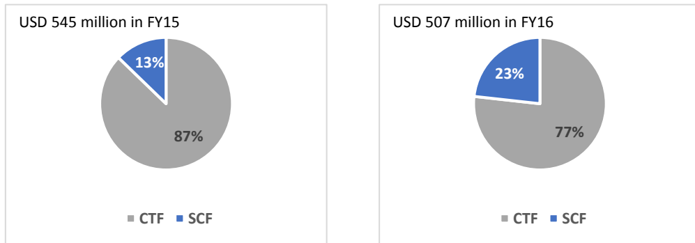
Figure 3: Shares in the annual disbursement (for FY15 and FY16)

7. The cumulative CIF disbursement ratio 4 has continued to trend upward as disbursements have been exceeding new project and program approvals. The disbursement ratio at the end of FY16 was 38%, an increase of 7 percent over FY15. This ratio is expected to increase further as the number of disbursing projects increases and the implementation of projects progresses.