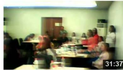
19 Juni 2014 Bali siang