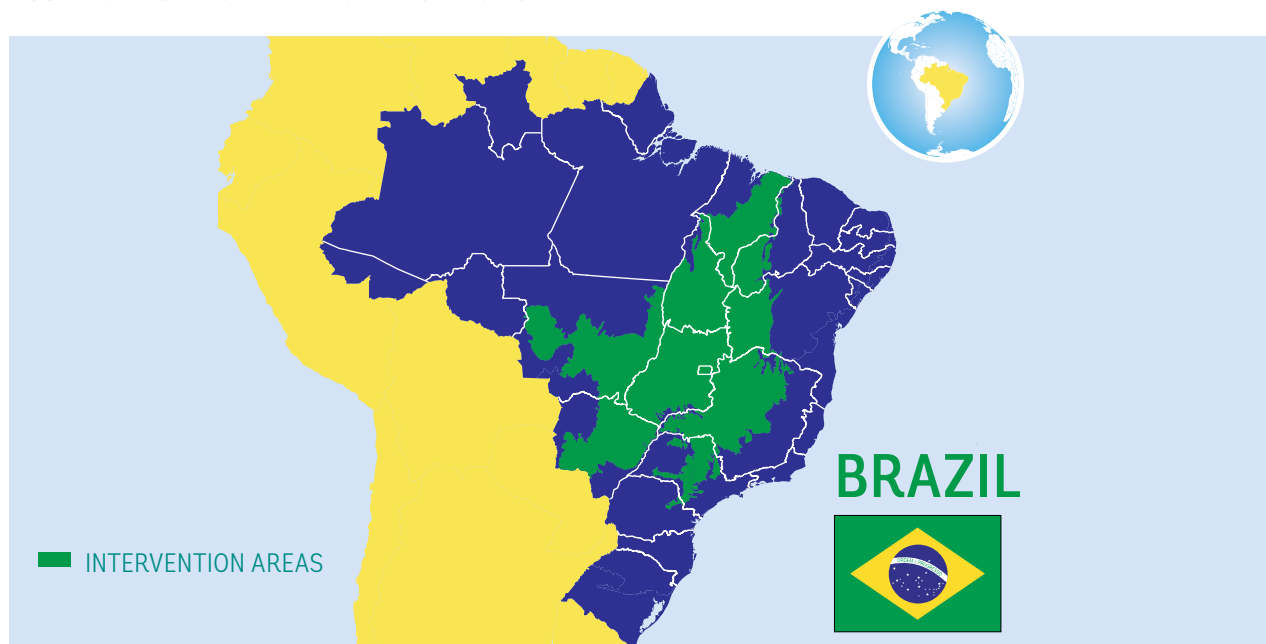
FIGURE 2. DGM BRAZIL INTERVENTION AREAS

women were generally more forthcoming with their opinions in small groups or individually. This was especially notable at Quilombo Pedra Preta where an hour of discussion and the voices of a few outspoken women eventually led to most of the community speaking up.