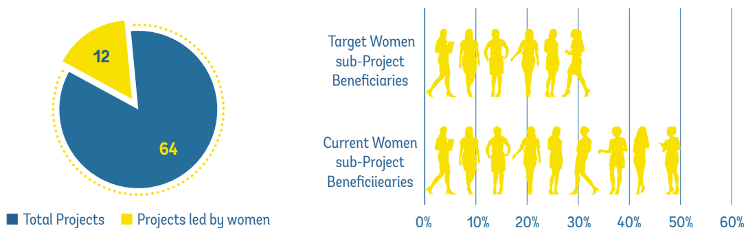
FIGURE 4. SUB-PROJECTS LED BY WOMEN AND WOMEN BENEFICIARIES

In 1991 the Quebradeiras only sold the nut from the babassu coconut, while other babassu products, such as soap, oil,